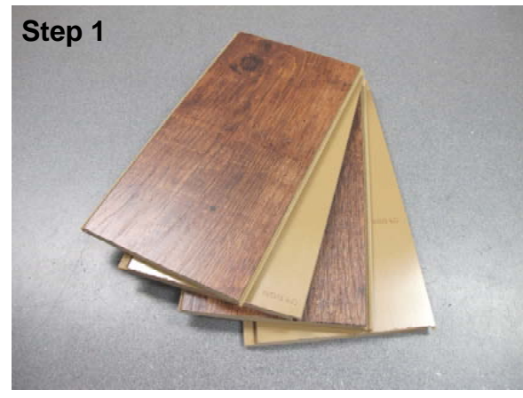
Cut 4 pieces 16-in (40-cm) long. Stack pieces back to back. Wrap stack in two layers aluminum foil.