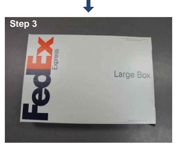
Place sample package in large FedEx box 18-in x12-in x3-in (45-cm x 30-cm x 7.5-cm) or your own box