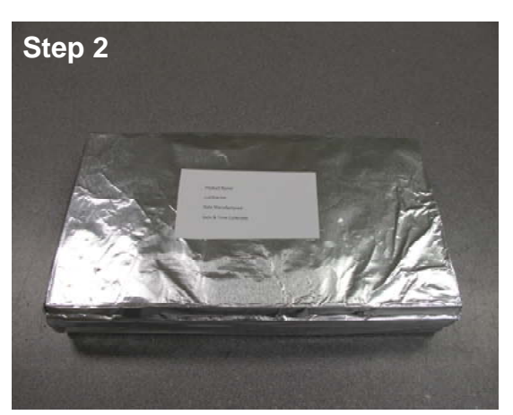
Label sample package – product name & number, date manufactured, lot/batch number, date & time collected